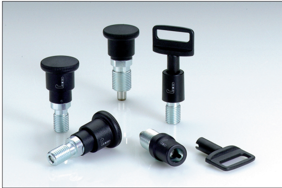
Locking plungers with and without key operation